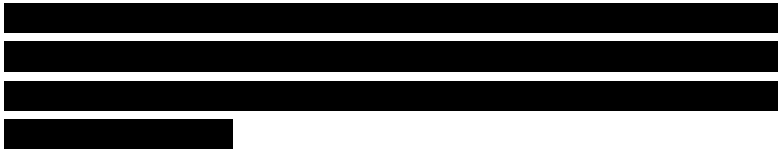
Figure 4.1.3-1 provides an easy reference to correlate narrative requirements to our proposal response.

Qwest has a long history of providing leading-edge voice and toll-free applications to the Federal Government. Flexible, reliable, and scalable,